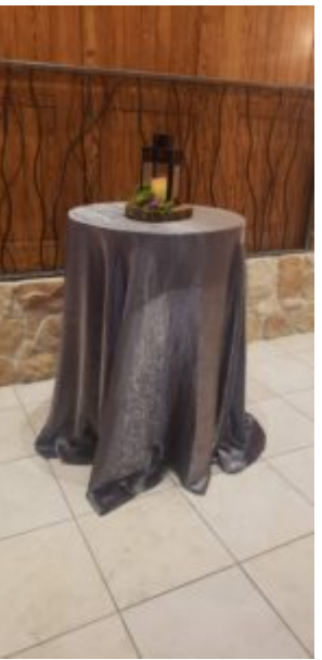
YOUR ONE-STOP-SHOP FOR EVERY EVENT

Thanks for choosing Event Resource Center | support@eventresourcecenter.com"